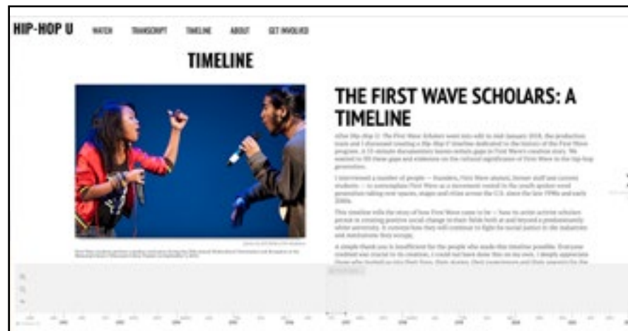
Screenshot from WPT's dedicated Hip-Hop U website which allows audiences to take a deeper dive into First Wave.