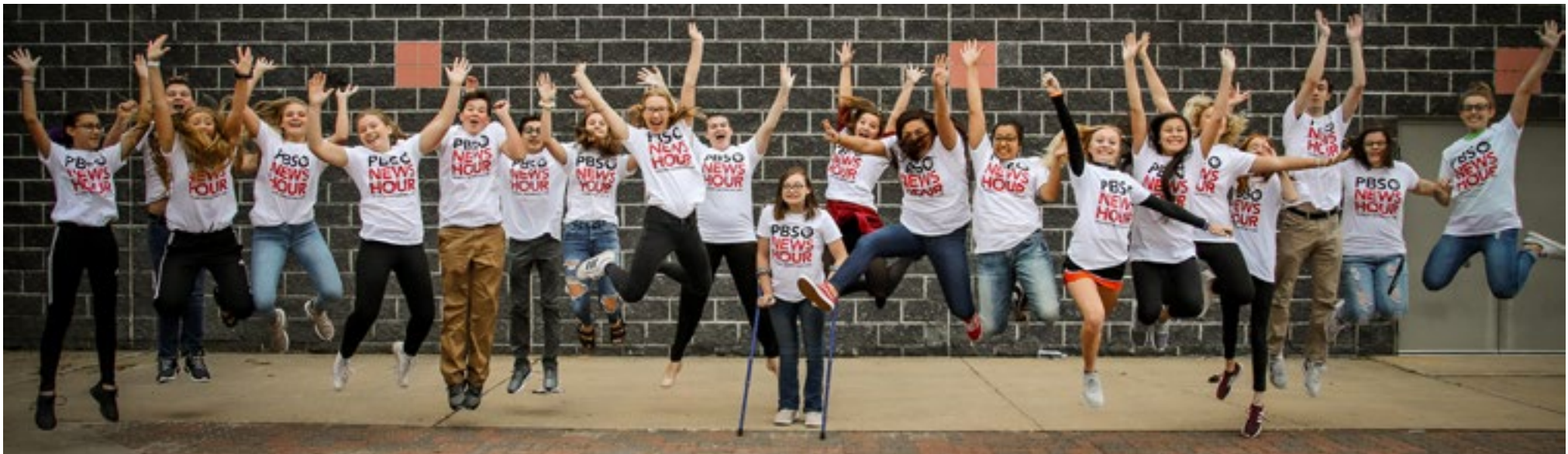
Student Reporting Lab students in Black River Falls, Wisconsin enthusiastically show their support for the PBS Newshour.

WPT Education incorporated WPR's Beyond the Ballot project into our work with kids this year. The WPR News team were looking for youth voices, and Beyond the Ballot provided a great opportunity to involve students in media that matters. Students engaged in and learned about the election process authentically, whether or not they were able to vote in November. WPT Education also led a breakout session for educators about using Beyond the Ballot in the classroom at the Teaching About the 2018 Elections Conference hosted by UW-Madison School of Education in September.