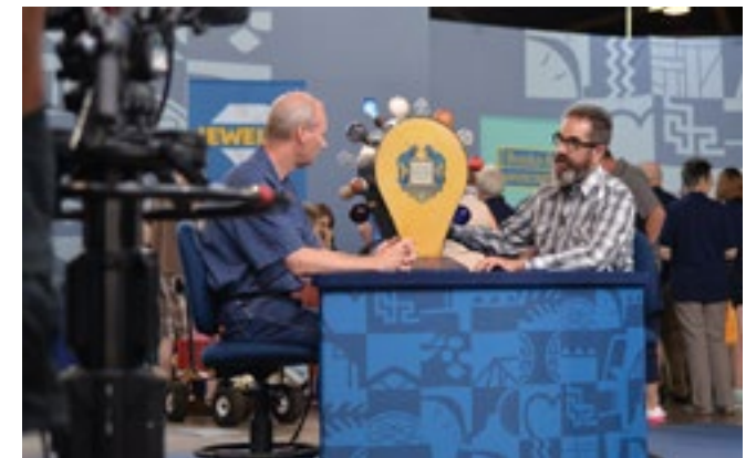
Behind the Scenes at Antiques Roadshow Green Bay.