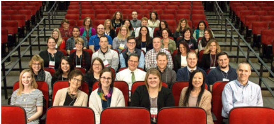
Participants gather at WPT’s second annual Education Innovation Summit.

WPT strives to serve teachers and students across disciplines, including the arts. Our Young Performers Initiative promotes and curates broadcasts of youth-focused performances from around the state each year. Our education team is developing much-needed digital resources for music educators and young musicians with our partners at the Wisconsin School Music Association. Wisconsinperforms.org is the home of music resources, video tutorials and curriculum