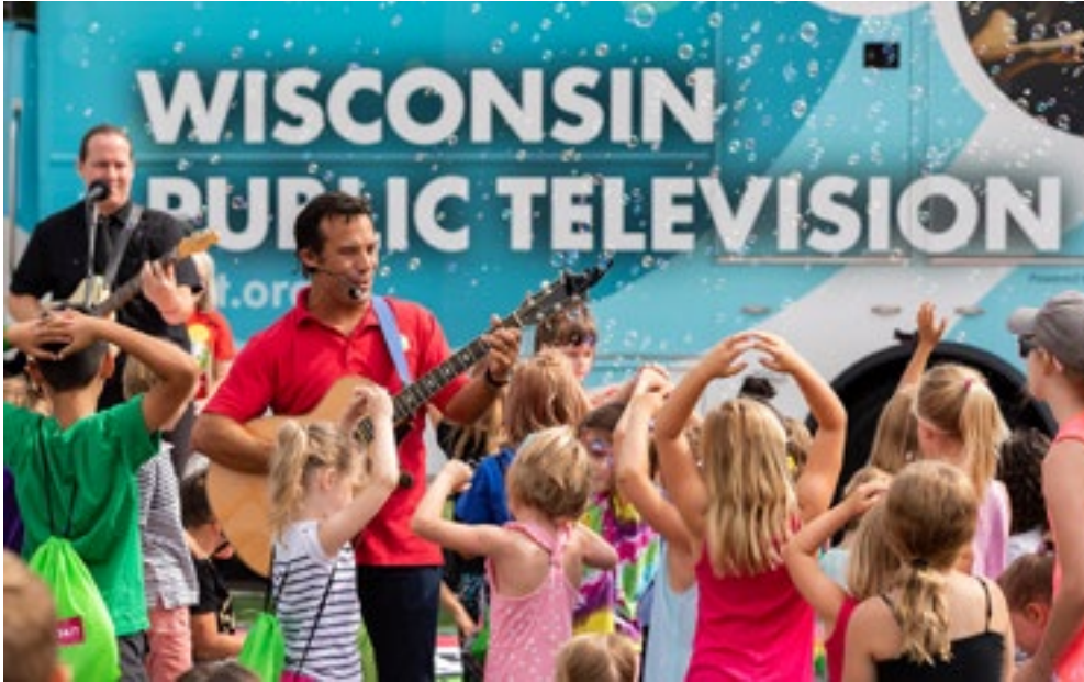
Get Up and Go! Day is highlighted by a performance from SteveSongs.