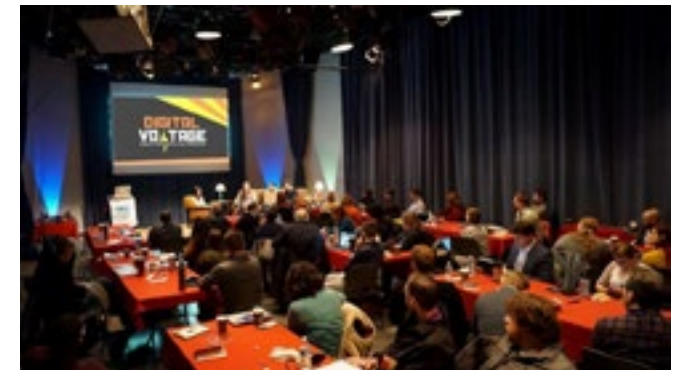
Staff from Wisconsin Public Media and five regional PBS member stations come together with PBS Digital Studios staff to learn and share at Digital Voltage.

Since Digital Voltage , WPT has formed a pitch development committee, created a logic model for digital content production and an assessment tool for determining the value and readiness of the station's digital content ideas. In July, WPT's logic model and assessment tool were shared with 19 PBS member stations. In October, WPT's first digital production, aka Teacher , was greenlit for production that is expected to begin in 2019.