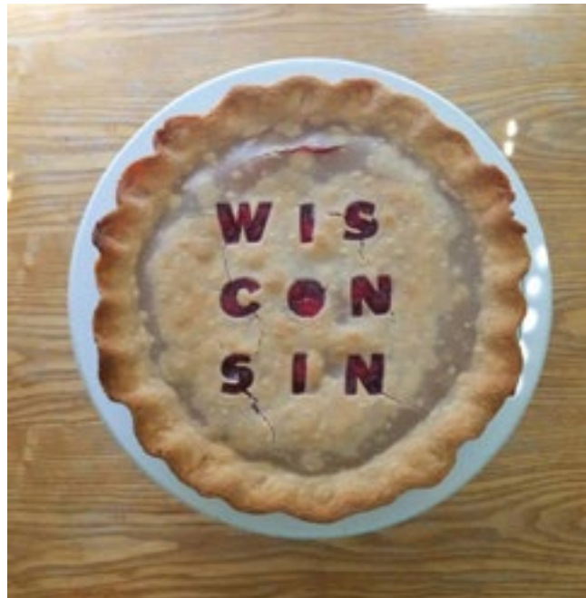
An entry from the Great Wisconsin Baking Challenge sums up what WPT is all about.

Food Traditions explores diverse expressions of identity through food. We explore how Panela cheese connects Jalisco, Mexico to Racine. We indulge in a Hmong Feast in Onalaska and learn about the importance of traditional white corn soup in the Oneida Nation. We explore family stories of rum cake in Fort Atkinson, Fry Bread in northern Wisconsin and a traditional Iranian dish in Madison. It’s a discovery of foodways and traditions that celebrate cultures and communities found across Wisconsin.