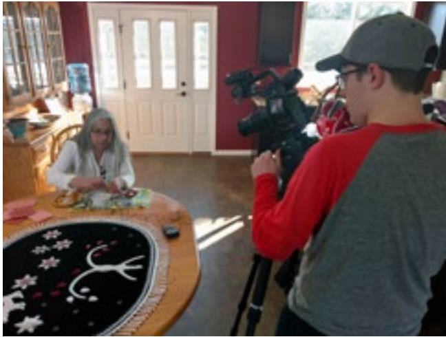
A story for the series Wisconsin Life is shot on location.

Wisconsin Public Television is an essential resource that brings a balanced and independent perspective to news and documentaries; inspires learning to broaden personal horizons; exposes new generations to music, art, theater and dance; and opens children's minds to new worlds of discovery.