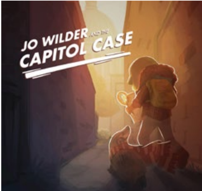
Jo Wilder and the Capitol Case gives elementary students the chance to serve as history detectives—having fun while learning in the classroom.

“I introduced Jo Wilder to my students. They are begging me to play. Two went home and played there. One had done it twice already. They love it. Thanks.”