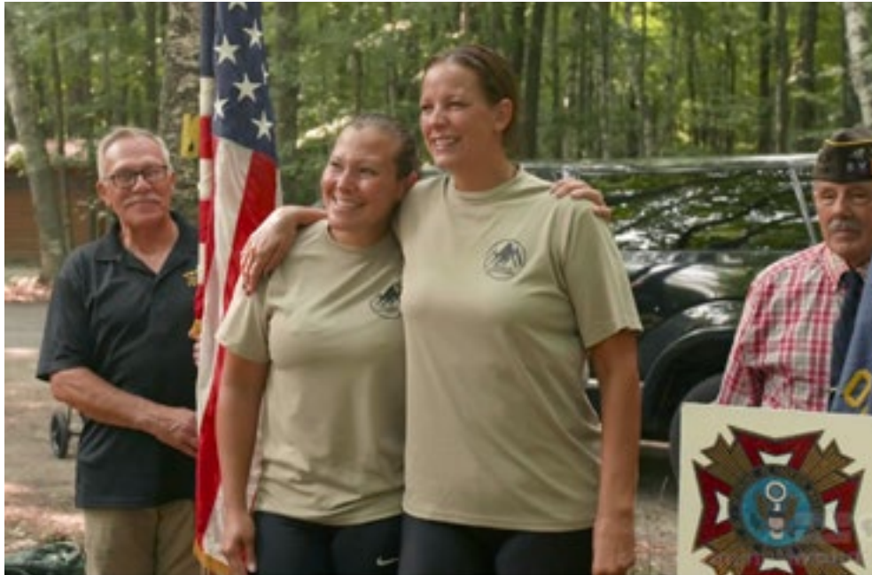
Two U.S. Army veterans hike Wisconsin’s 1,200 mile Ice Age Trail to reflect on and process their wartime experiences as they transition to civilian life.

Veterans Coming Home is an innovative cross-platform public media campaign exploring “what works” for veterans as they return to civilian life – exploring the challenges, and celebrating the success stories, of veterans who are making a difference in the workplace, on campus and in their communities.